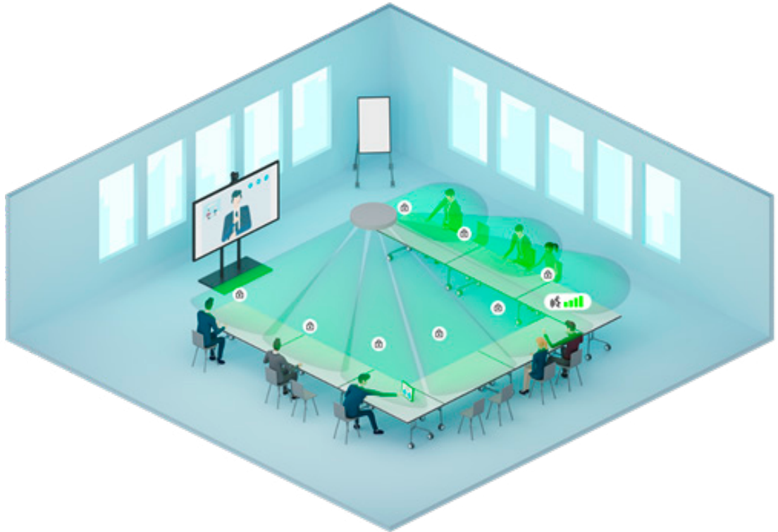
Ceiling microphone with multiple beamforming zones

Ceiling microphone arrays with multiple beamforming zones use pre-configured, static and separate recording areas . The width and directivity of the beams must be pre-defined and fixed. These settings can be saved as pre-sets in the configuration software. For the initial alignment of the individual zones, a set-up mode is usually used. For this purpose, test speech is spoken in the designated zones and the beams are aligned accordingly. The zones can be aligned even more precisely by means of manual fine tuning, i.e. configuration using a software interface. Speech recognition using the auto mixer allows multiple speaking zones to be activated simultaneously. As a combined signal from the static recording areas, the audio channels are bundled so that in the event of several attendees speaking simultaneously, everything that is said can be reproduced with consistent audio quality and volume.