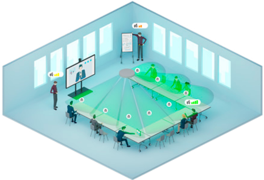
Audibility for different speaking positions in the meeting room inside and outside the preconfigured zones (green = good audibility, orange = reduced audibility)

Since in defined speaking zones there is no dynamic, automatic alignment of the microphone beam to the person speaking, audibility decreases as soon as the speaker leaves their pre-configured zone. This restricts speakers' freedom if, for example, they want to leave their seat at the table to write something on the whiteboard.